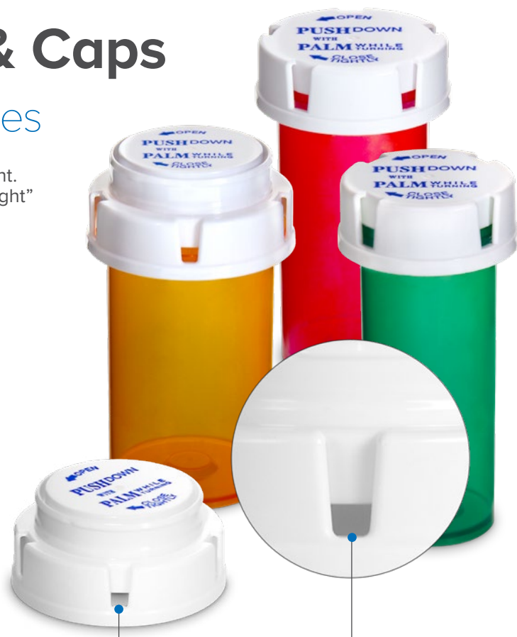
Improved closure enhances comfort