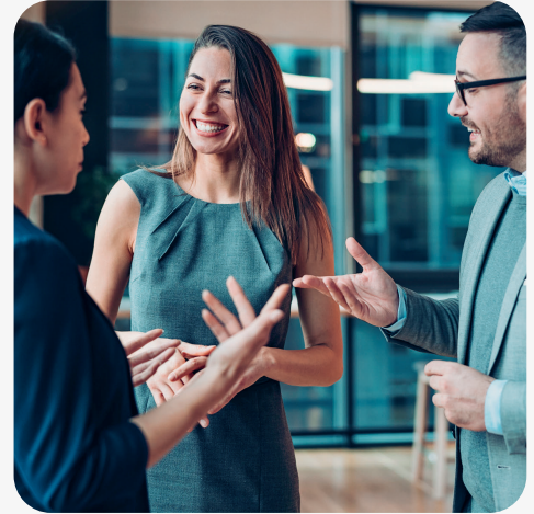
Exhibit Booths Include:

Registering for the 2024 Expo & CE is so much more than an exhibit booth. Attending is a time to network with local independent pharmacies, take in important industry information, and spend valuable time with those that mean the most for your business.