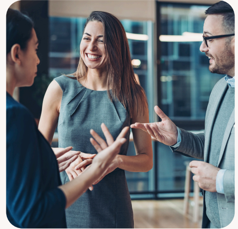
Exhibit Booths Include:

Registering for the 2024 Expo & CE is so much more than an exhibit booth. Attending is a time to network with local independent pharmacies, take in important industry information, and spend valuable time with those that mean the most for your business.